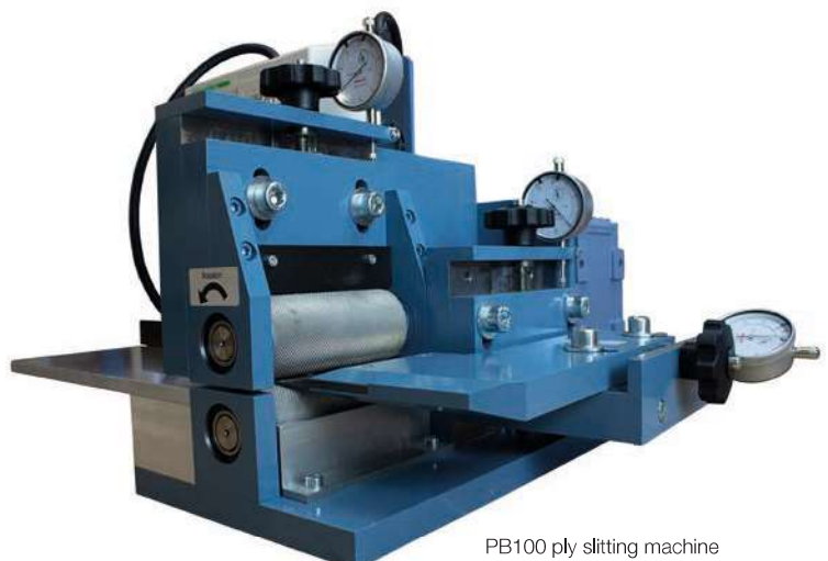
PB100 ply slitting machine