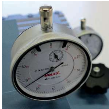
Control by comparator in 1/100 mm