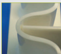
Fitting of cleats that connect to the back of the waves