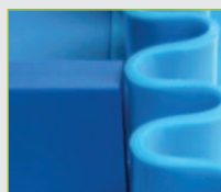
Fitting of cleats tangent to the Compart's wave